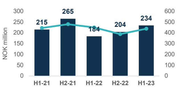
Revenue rolling 12 months

In the first half of 2023, revenue reached NOK 233.8 million, a solid increase from NOK 183.8 million in the same period of 2022. While Syncrolift remains the primary revenue driver, with 90 percent of 2023's first-half revenue. Intellilift and Techano Oceanlift (included from Q2) have become significant contributors, jointly accounting for revenues of NOK 26 million in the first half of 2023, compared to NOK 11 million in the same period last year. This revenue diversification highlights the growing influence of these segments on the company's overall financial performance